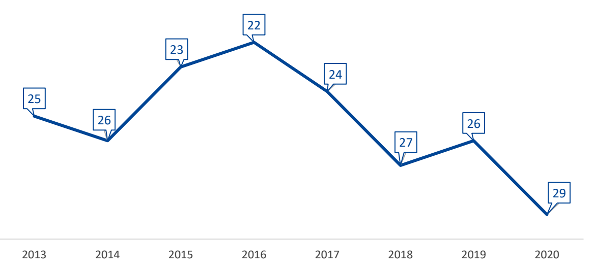
Chart 4: Ranking of the Czech Republic in the overall Universitas 21 ranking from 2013 to 2020