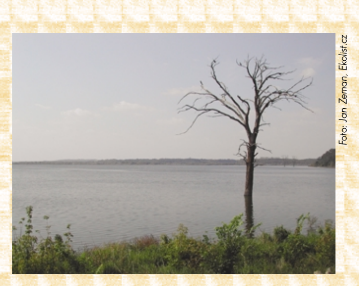
Nové Mlýny Water Work

The implementation of environmental projects and measures in the Thaya River Basin was detrimentally affected by the lack of cooperation between the sectors of ME and MA. The fact that cooperation was not at a desirable level was reflected, e.g., in implementation of the supra-regional bio-corridor in the territory of the Nové Mlýny Water Work where investments were partially wasted. Two islands constructed in the middle reservoir from the means of the state budget and SEF are mostly submerged because of the higher water level and cannot thus completely fulfill the purpose for which they were constructed.